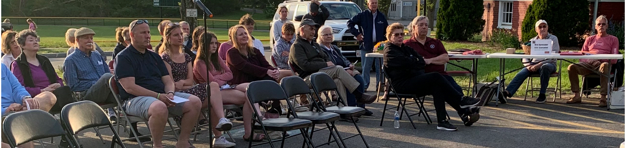
Friends and neighbors enjoy the outdoor WBCA Meeting.